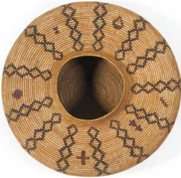
79 (alternate view)