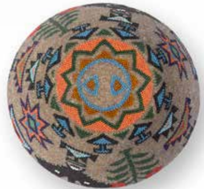
92 (alternate view)