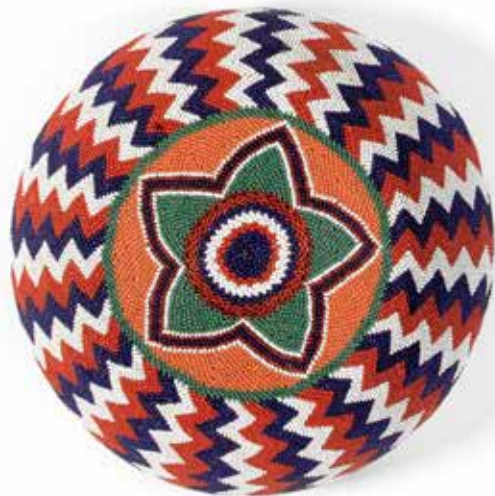
88 (alternate view)