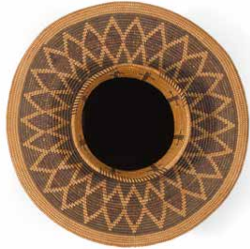
80 (alternate view)