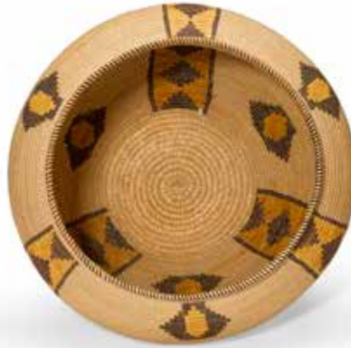
69 (alternate view)