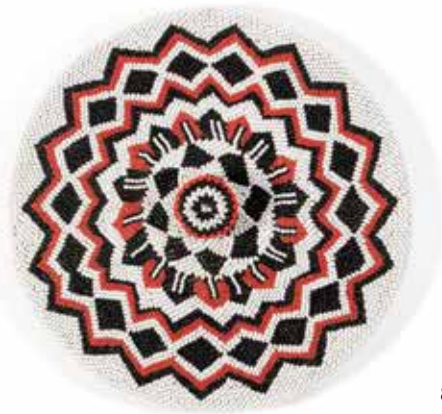
87 (alternate view)