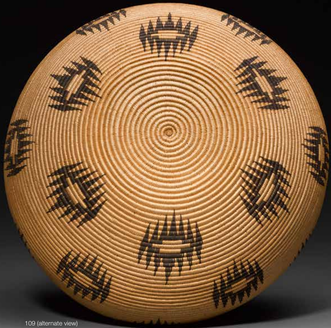
109 (alternate view)