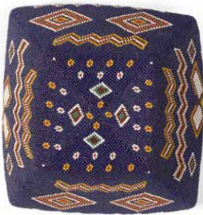
85 (alternate view)