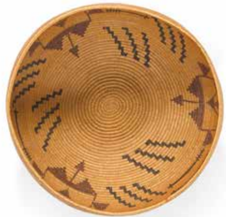
115 (alternate view)