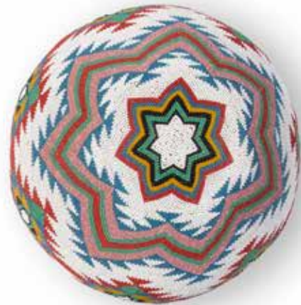
94 (alternate view)