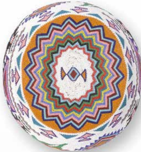
91 (alternate view)