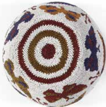
96 (alternate view)