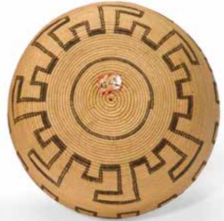
70 (alternate view)