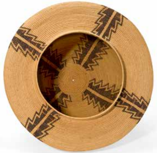
47 (alternate view)