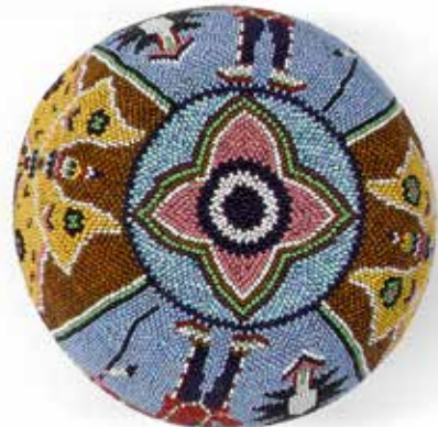
98 (alternate view)