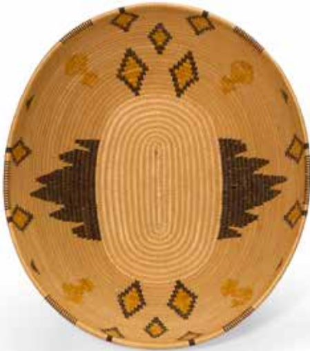
68 (alternate view)