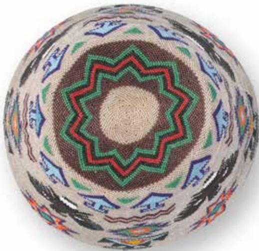
90 (alternate view)