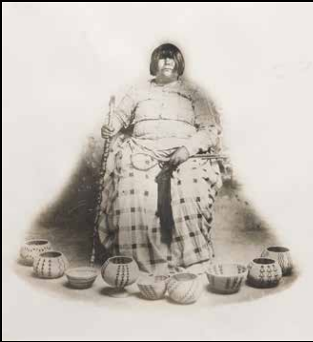
The weaver Dat So La Lee, Louisa Keyser, pictured with the present lot, far right