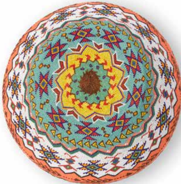
93 (alternate view)