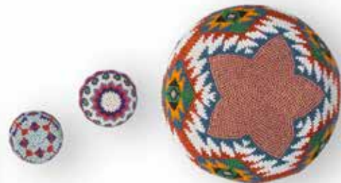
95 (alternate view)