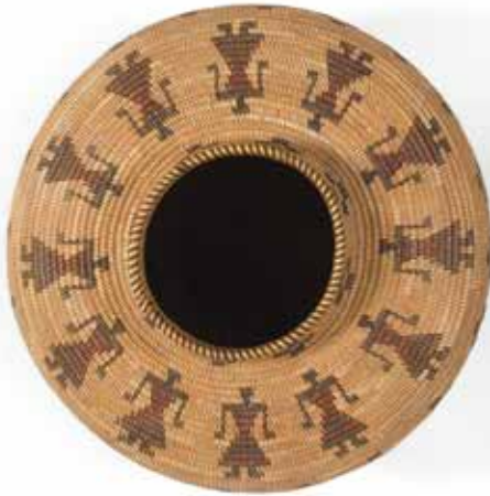
81 (alternate view)