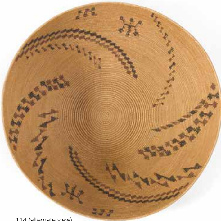
114 (alternate view)

The original Cohn Emporium certificate accompanies this lot.