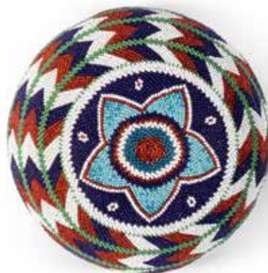
89 (alternate view)