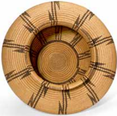
45 (alternate view)