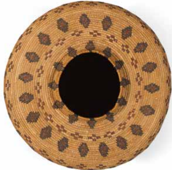
82 (alternate view)