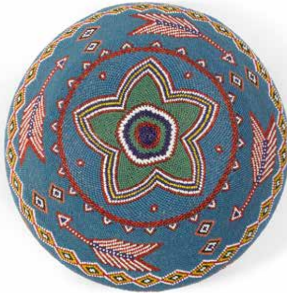
84 (alternate view)