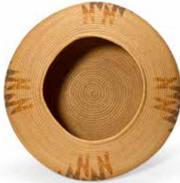
46 (alternate view)