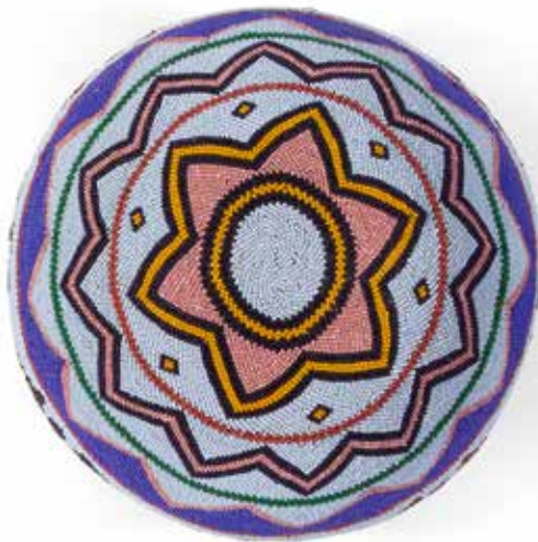
97 (alternate view)