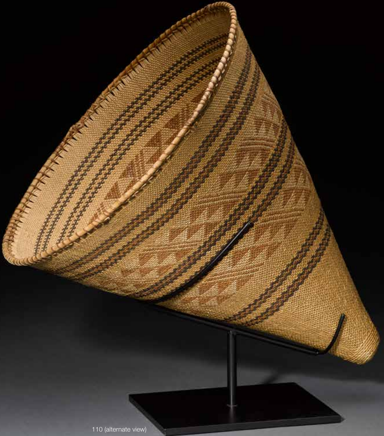
110 (alternate view)