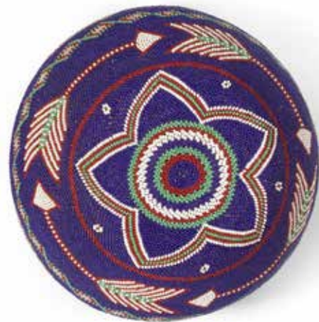
86 (alternate view)